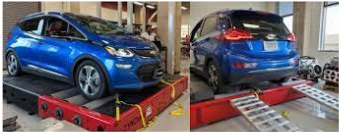
Figure 1. Chassis dyno with EV under test.